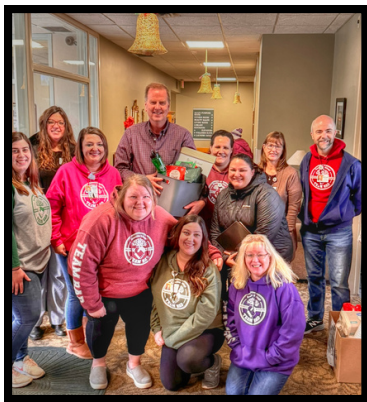
Read More Inside!